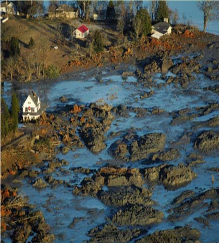
Kingston Dam Rupture