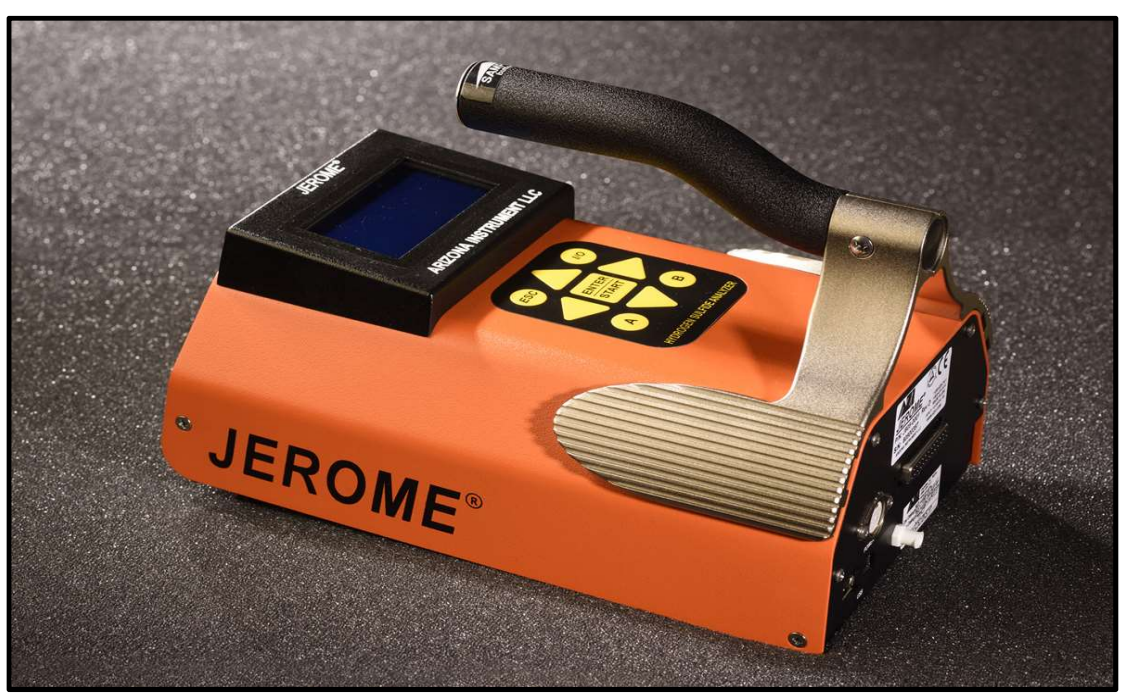
Jerome® J605 Hand-Held Hydrogen Sulfide Analyzer