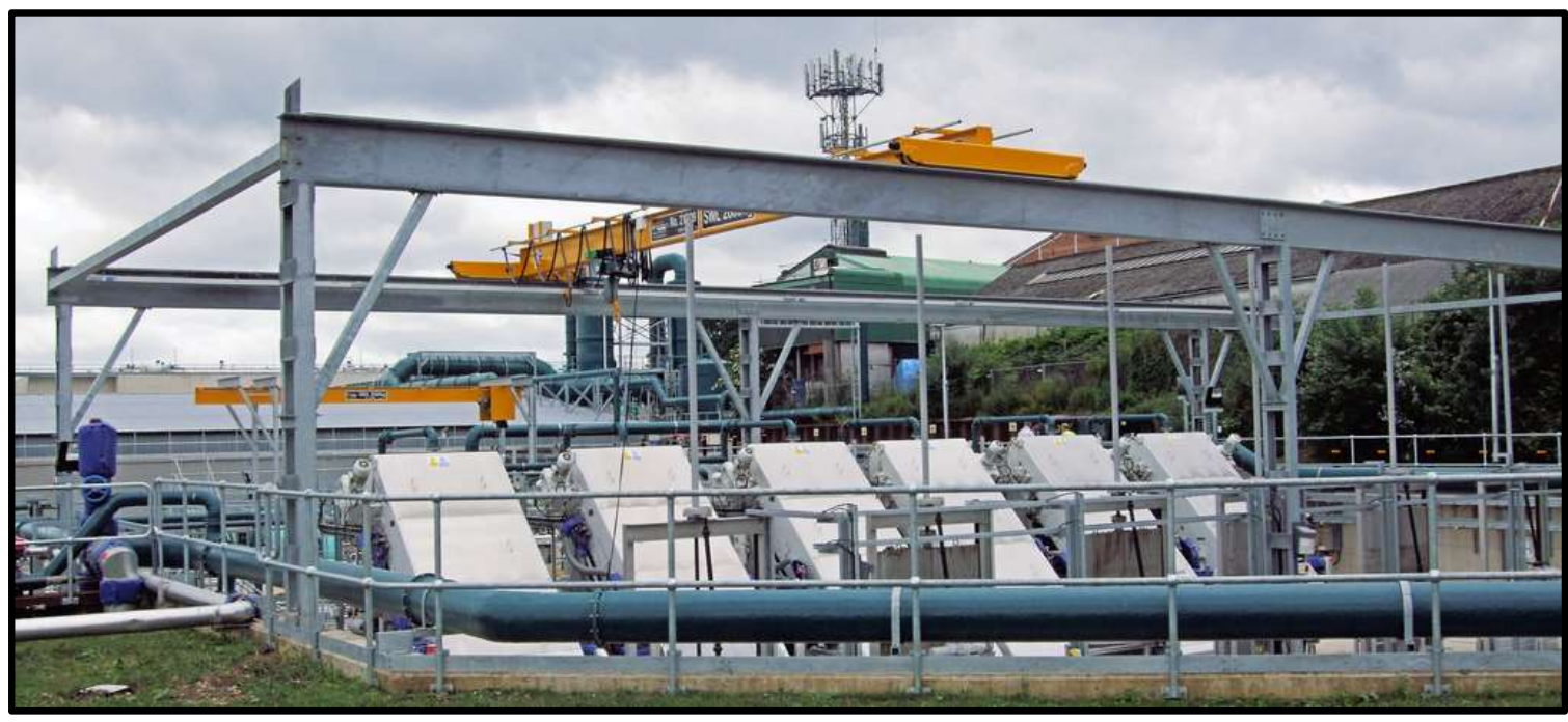
Primary Treatment Mechanisms at Mogden Sewage Treatment Words, Isleworth - London J. Linwood