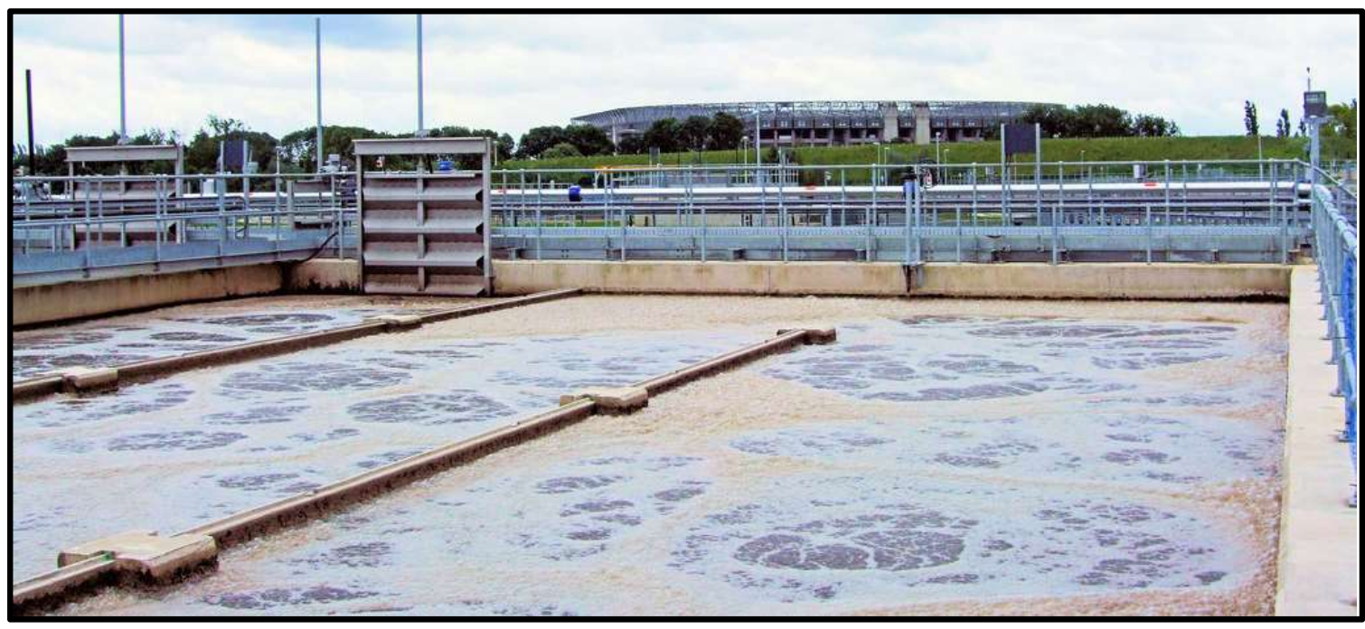
Twickenham Rugby Stadium seen from Mogden Sewage Treatment Works - London J. Linwood