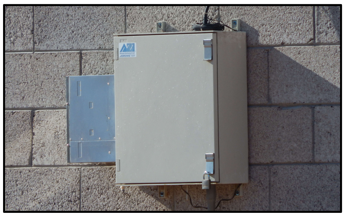
Jerome® 651 Hydrogen Sulfide Monitoring System