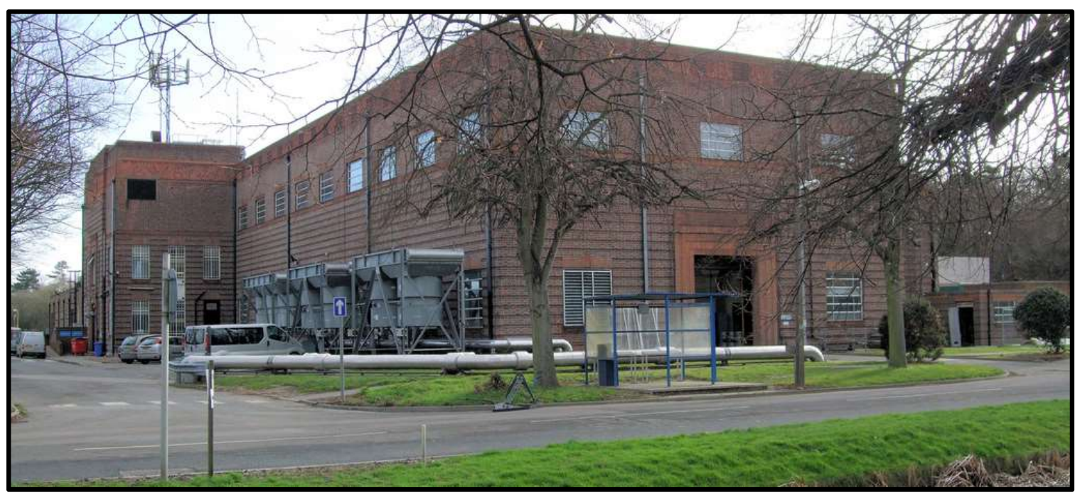
Mogden Sewage Treatment Works, Isleworth - London. Jim Linwood

Mogden Sewage Treatment Works: London, UK