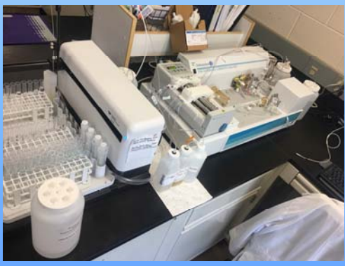
OI Analytical FS3700 Segmented Flow Analyzer, Set Up for TKN by EPA 351.2